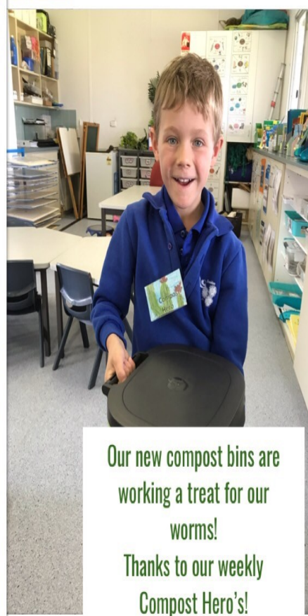
Our new compost bins are working a treat for our worms! Thanks to our weekly Compost Hero's!