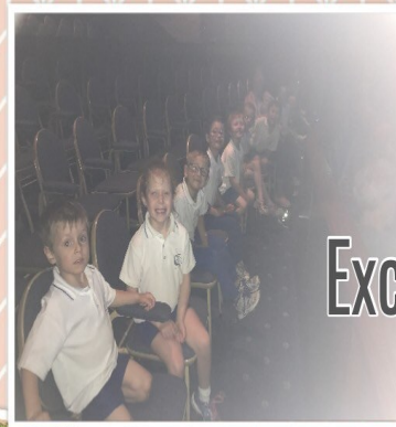
Excursion to watch 'Diary of a Wombat'