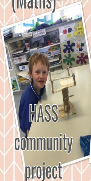
HASS community project