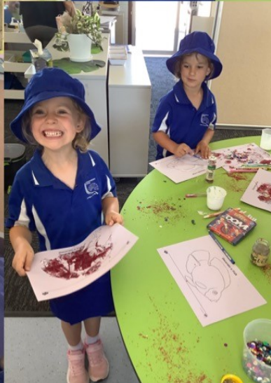
Creating our own exquisite fish