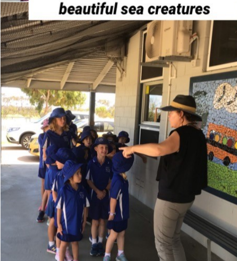
All aboard the bus to the Northern coast of Western Australia