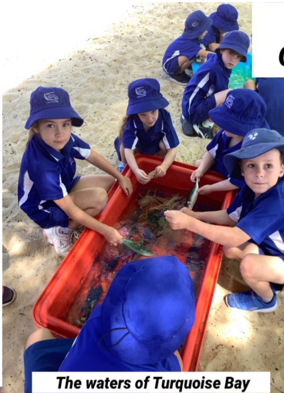
The waters of Turquoise Bay