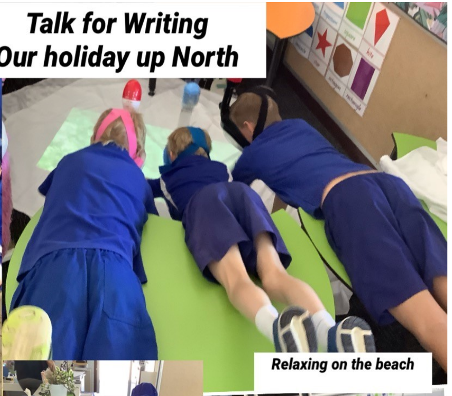
Relaxing on the beach